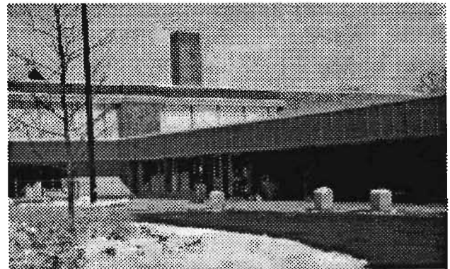
Grace A. Dow Memorial Library